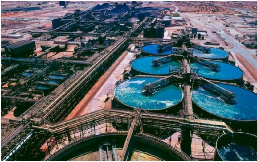
An aerial view of a uranium mine in southern Australia owned by BHP Billiton

Canada's Cameco, the world's largest listed uranium producer, believes that 500m pounds of uranium that will be needed for reactors in the next 10 years have not yet been purchased.